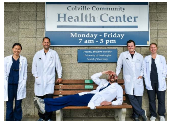
NEW Health Colville Dental