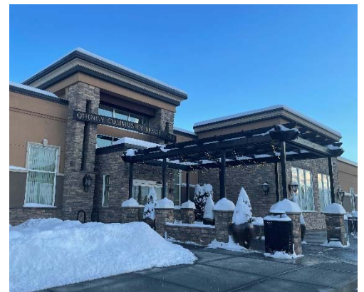
Quincy Community Health Center