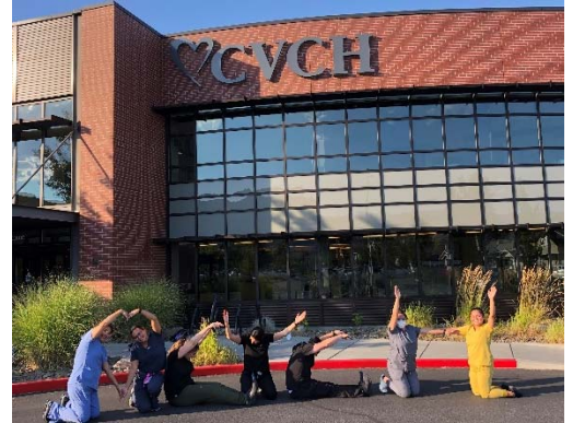
Columbia Valley Community Health, Wenatchee Medical, Dental, & Behavioral